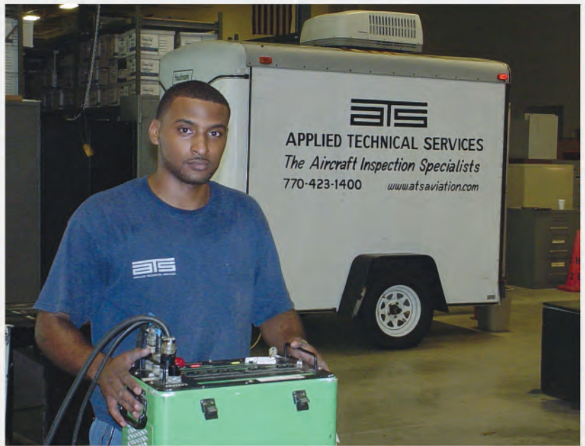
Radiography with a mobile darkroom

ATS can provide experienced NDT personnel to help your NDT department handle temporary or unexpected work loads.