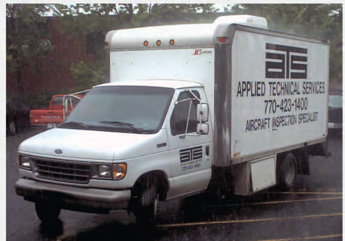
ATS gets the job done 24/7, rain or shine.