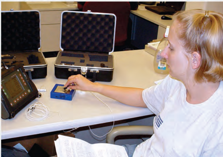
Shearwave ultrasonic inspection of a GE engine

Training and certification records are available for your inspection.