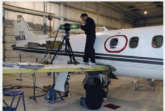
Radiography looking for corrosion and cracks on wing